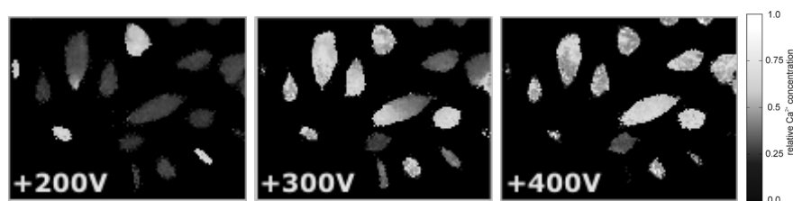
Figure 2: Cells stained with Fura-2AM and exposed to electric pulse with increasing amplitude.

Using a BetaTech device, deliver one electric pulse of 100 μs with voltages varying from 150 to 300 V. Immediately after the pulse, acquire two fluorescence images of cells at 540 nm, one after excitation with 340 nm and the other after excitation with 380 nm. Divide these two images in MetaFluor to obtain the ratio image ( R = F_{340}/F_{380} ). Wait for 5 minutes and apply pulse with a higher amplitude. After each pulse, determine which cells are being electroporated (Figure 2). Observe, which cells become electroporated at lower and which at higher pulse amplitudes.